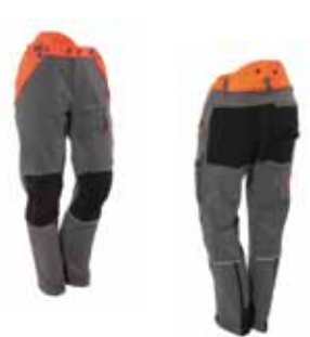
Tree climbing trousers with anti-cut protection, resistant to chain speeds of up to 20 m/sec